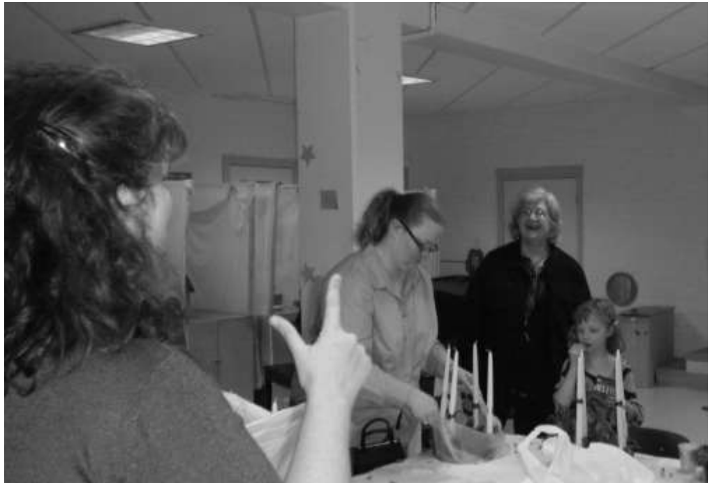
Deaf Children's Bible Story Group Advent Wreath Workshop in Hines Hall