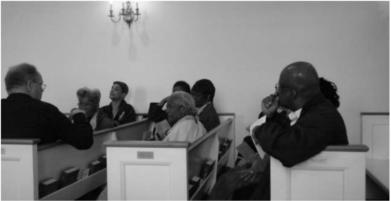
Members of All soul's Church in the chapel before the Palm Sunday service.