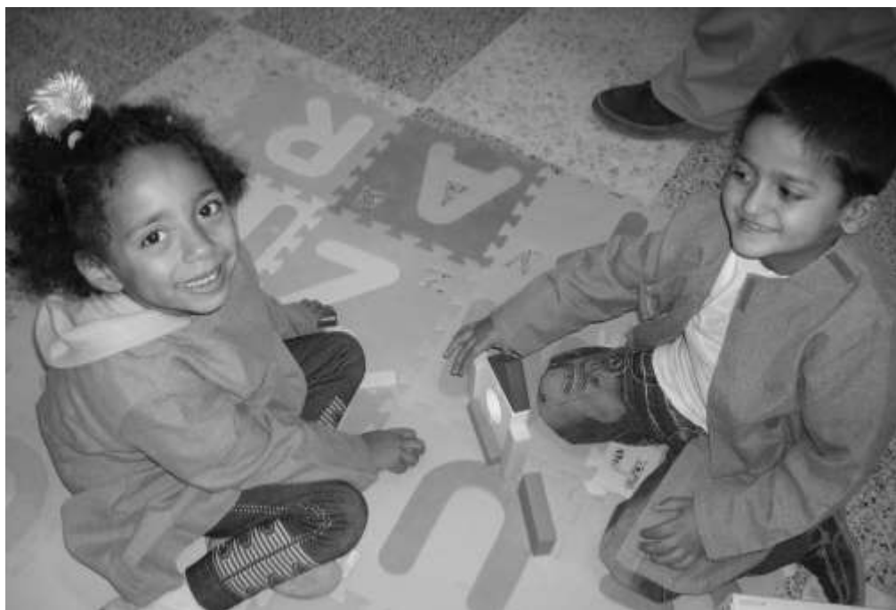
Two young students at the Holy Land Institute of the Deaf