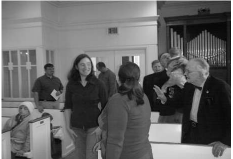
Congregation gathers for the service