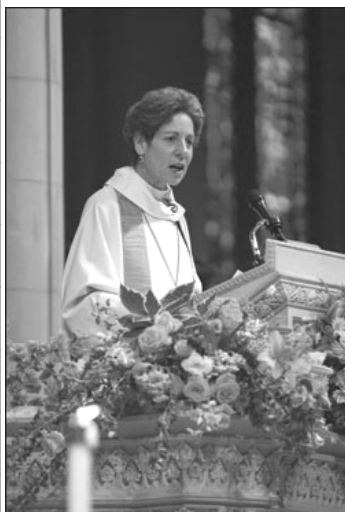
Bishop Katharine, photo courtesy of Episcopal News Service

THE NEW PRESIDING BISHOP WAS WELCOMED WITH APPLAUSE, INCLUDING "DEAF APPLAUSE" FROM THE SECTION RESERVED FOR THE DEAF COMMUNITY.