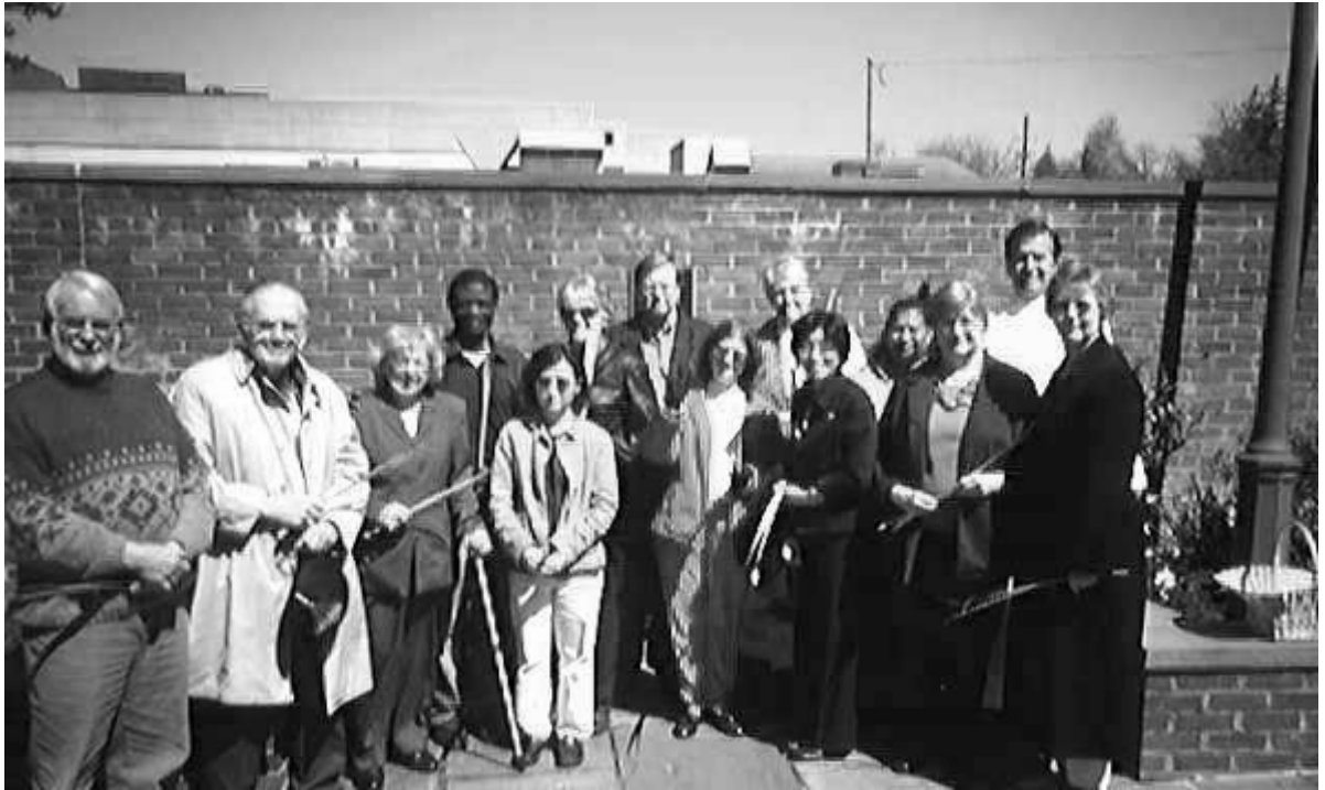
Above: on Palm Sunday, St Barnabas' members gathered outside, with palm leaves in hand, ready to process in to the chapel