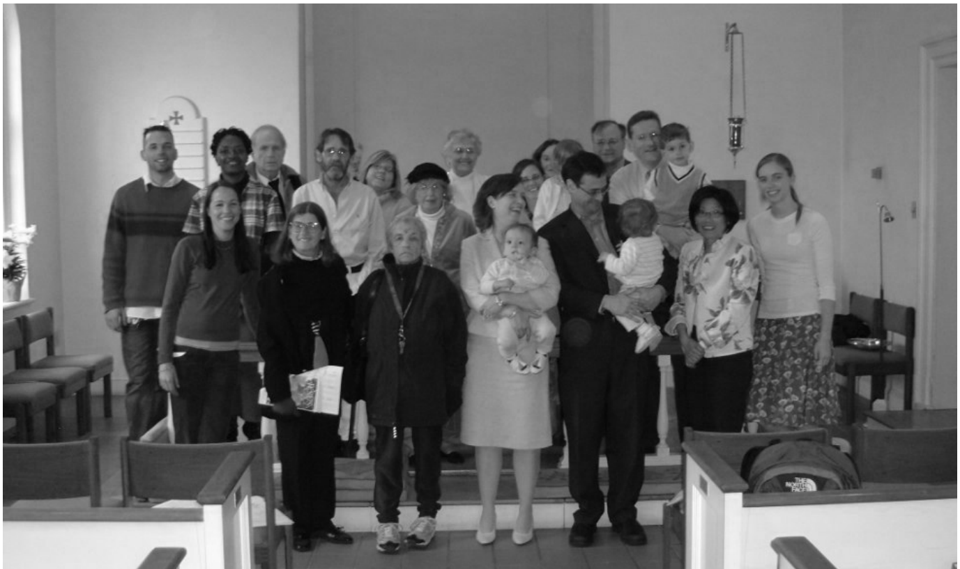
The congregation including guests poses for a group photo after the Easter Sunday service.