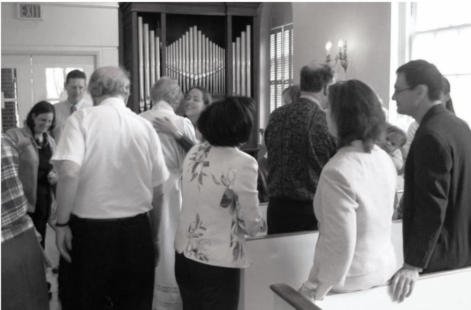
The congregation passes the Peace before Holy Communion